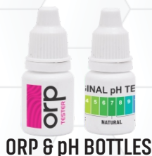
ORP & pH BOTTLES